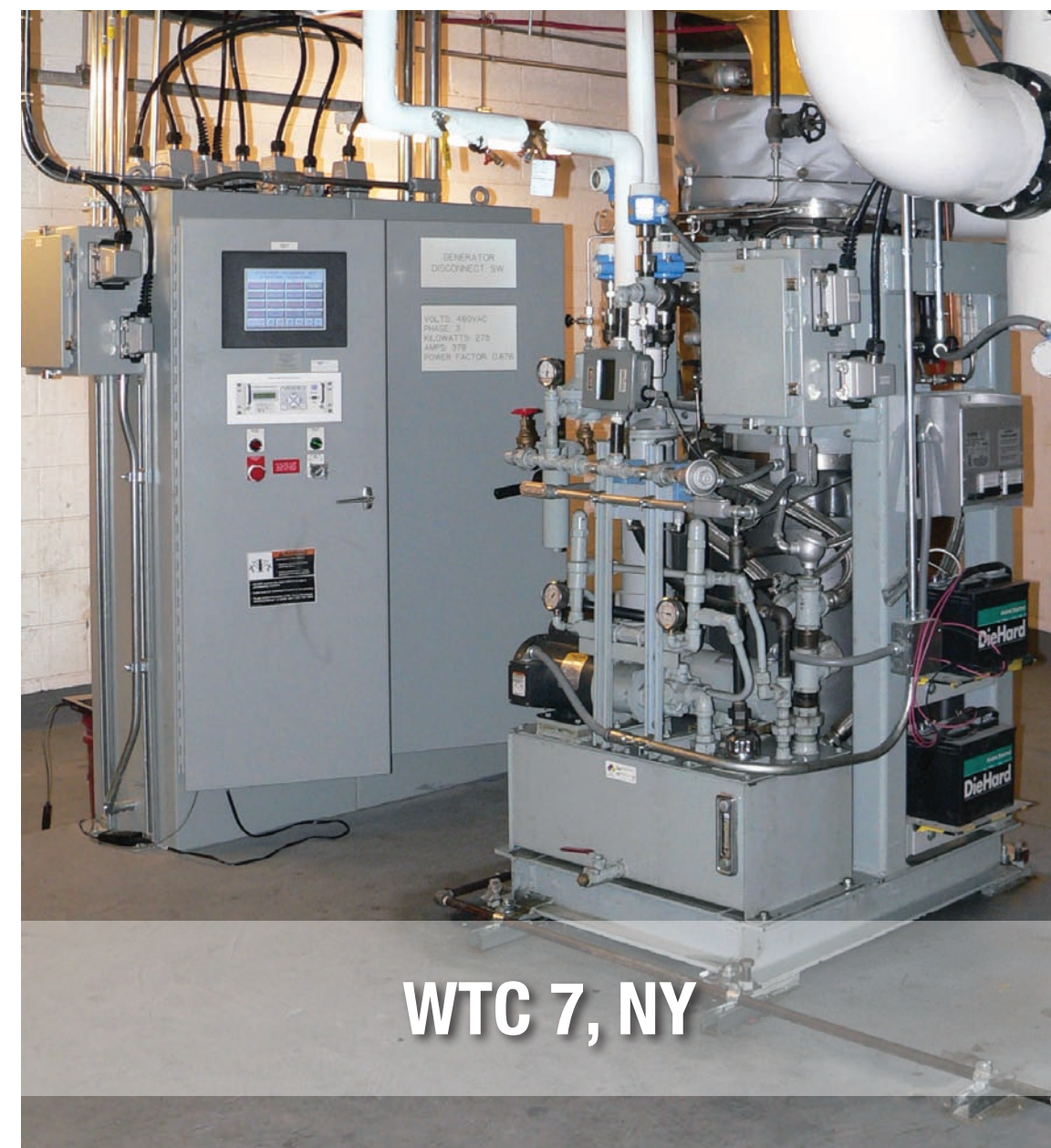
WTC 7, NY