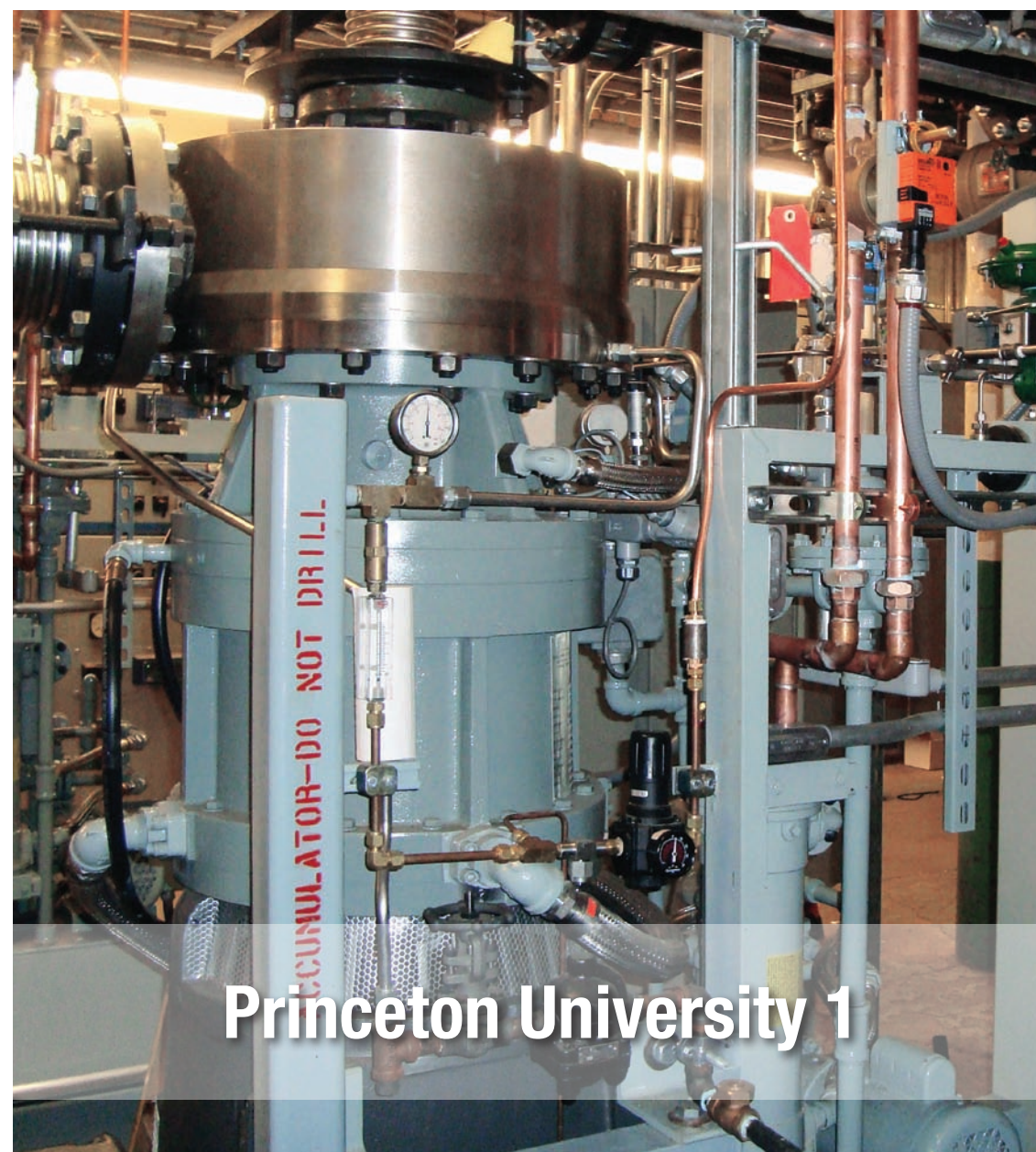
Princeton University 1