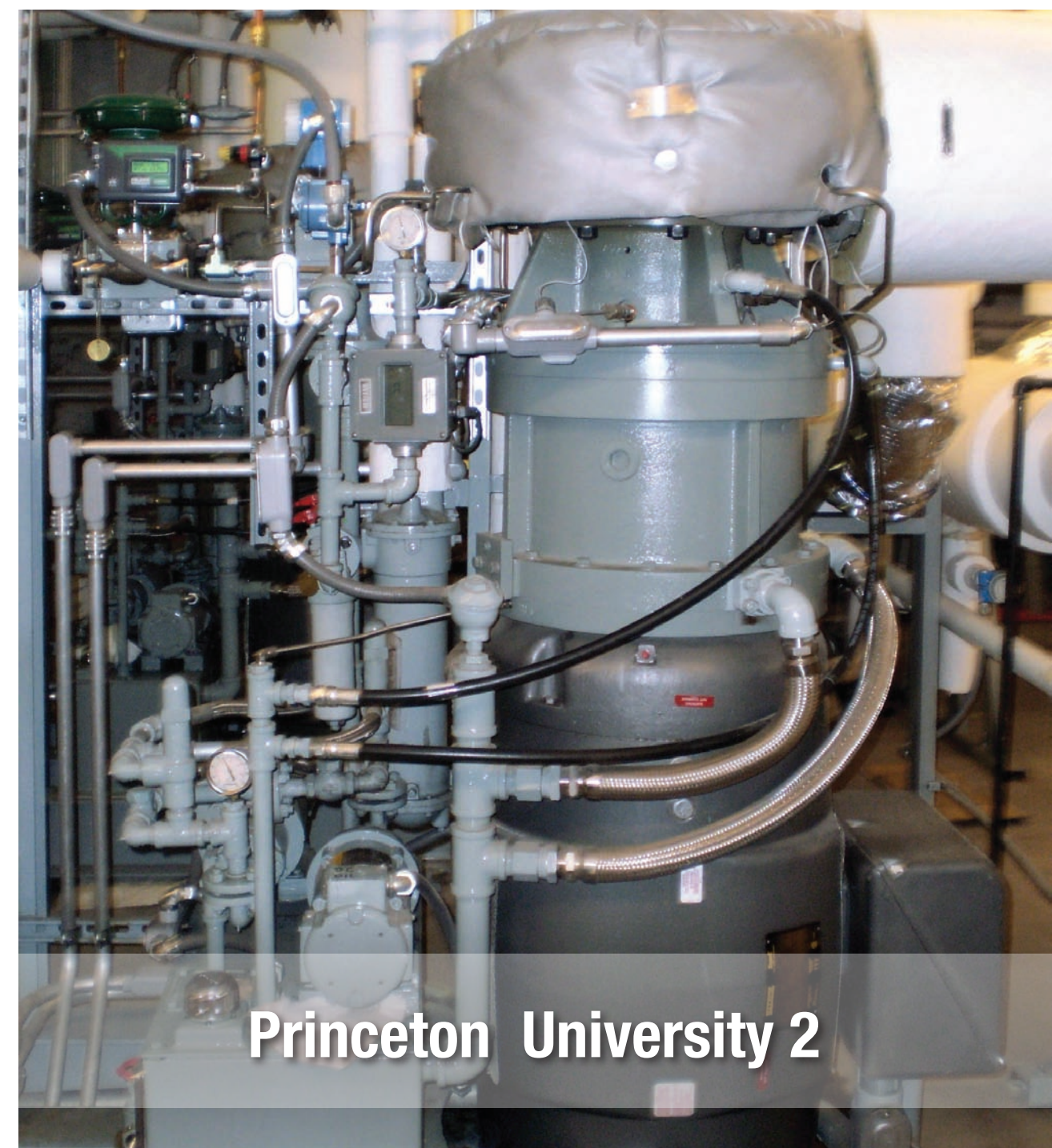
Princeton University 2